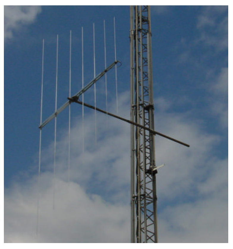
- Installation sample-

This AM401-x is an antenna mount kit that makes it possible to mount a horizontally mounted antenna CLP5130-x series vertically which consists of side-sticking boom and fitting fixtures.