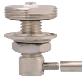
EM-MTR11001 Thick Panel